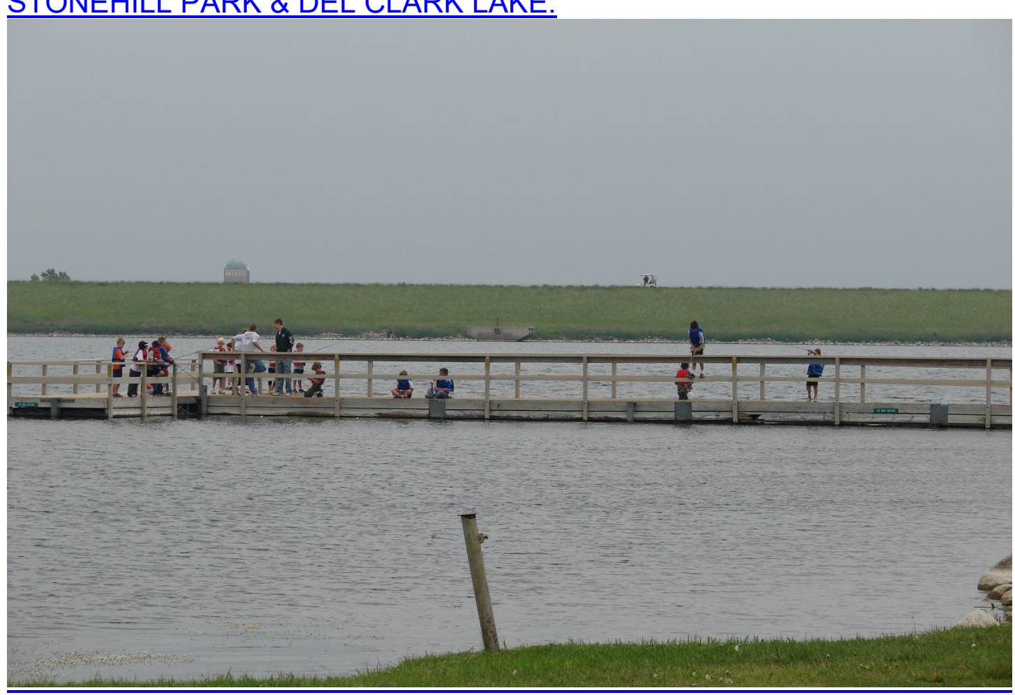
The (R-1) dam known as Del Clark Lake was built in the fall of 1985 as part of the Canby Creek Project to prevent the City of Canby from yearly flooding that cost thousands of dollars of damage annually. This dam is one of the largest earthen dams built in Minnesota. To get the cost/benefit ratio for the project, the Watershed District was required to include a recreational area which was named Stonehill Park/Del Clark Lake. Stonehill Park/Del Clark Lake offers a handicap accessible dock and pier, one of the few in the State of Minnesota. The lake is 154 acres and has a maximum depth of 30 feet. The park and lake are a popular destination and in 2019 estimated that approximately 1,800 people visited the park from several states & Canada throughout the year. Ice-fishing is a very popular activity in the winter months.