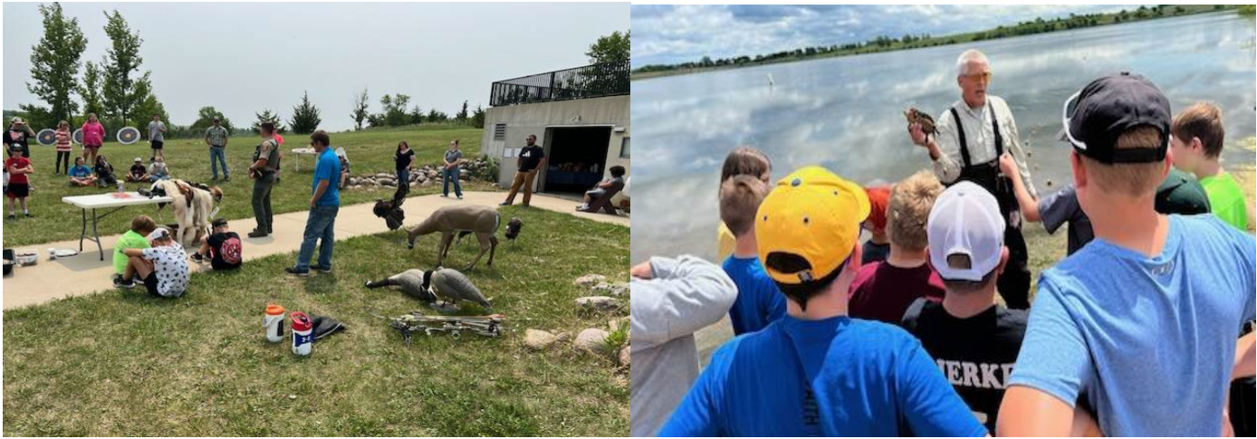
NO CHILD LEFT INSIDE EVENT PHOTO'S

shelter and started supper. Once they finished supper the rain was over and it was a nice evening where we went back to the beach to resume kayaking, fishing, swimming. We then came back to campground and did smores and ended the evening with star gazing and lights out. In the morning we had breakfast pizza's, took the tents down, and the kids went home. With the DNR grant we were able to purchase 10 kayaks, 25 deer calls, 13 fishing rods, 10 life jackets, and 5 tents so we could hold this event another year if so desired. SWCD provided a bus for transportation which allowed more students to attend.